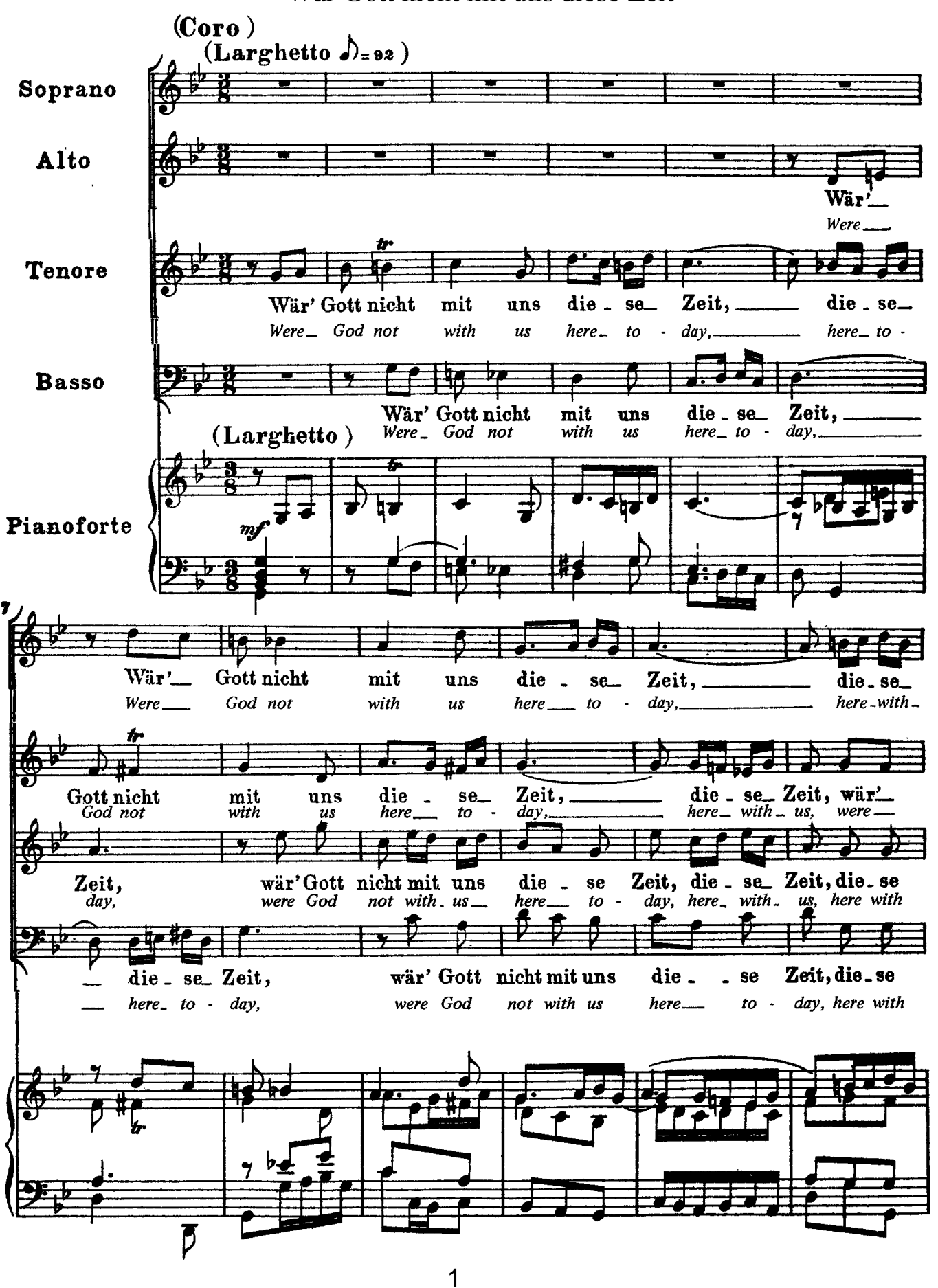
J.S. Bach Cantata No. 14 Wär Gott nicht mit uns diese Zeit